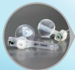
danuButton® Gastrostomy Button