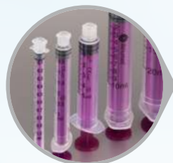
danumed® Enteral Syringes, Single Use Enteral Syringes, Single-Patient Use

danumed Medizintechnik GmbH – Individual solutions are our standard.