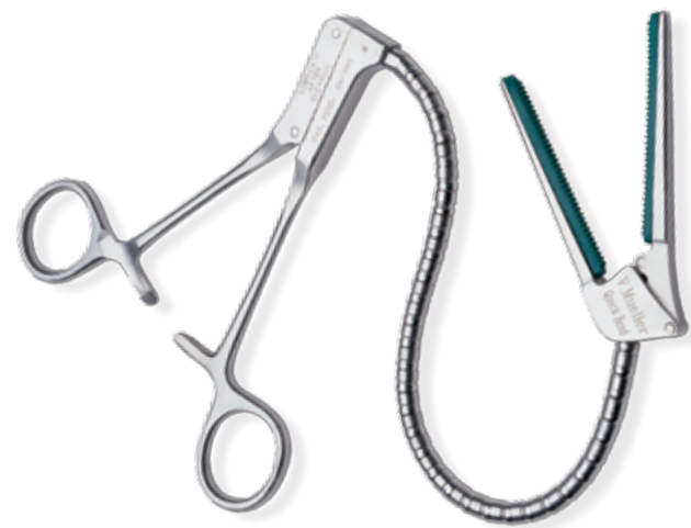
Cosgrove Flex Clamp QuickBend Clamp with EverGrip Inserts