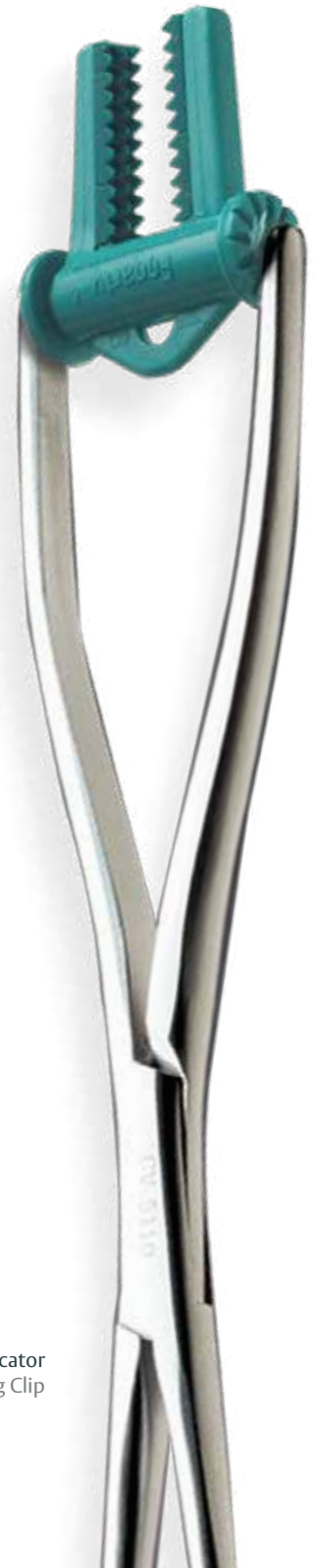
Spring Clip Applicator with EverClip Spring Clip

Edwards atraumatic occlusion products are not made with natural rubber latex.