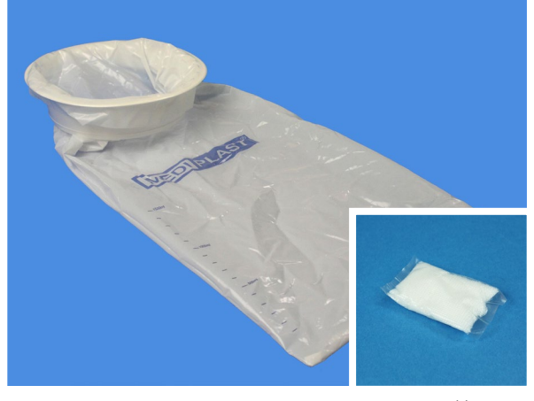
SAP inkl in art.nr 601134K