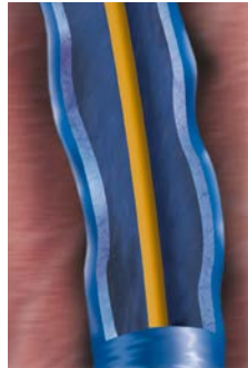
Disposable catheter inserted into vein