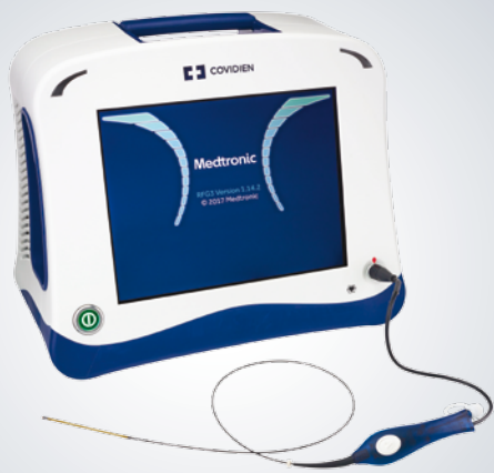
ClosureFast™ Radiofrequency Ablation System