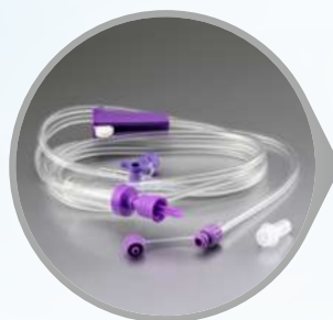
danumed® Gravity Spike, Gravity Universal and Gravity Feedbag Gravity feeding sets

Forhandler: MEDI PLAST Medioplast AS Bjørnstjerne Bjørnsonsgate 110 3044 Drammen T 32 88 11 00 mediplast@mediplast.no www.mediplast.com