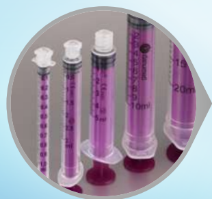
danumed® Enteral Syringes, Single Use and Single-Patient Use