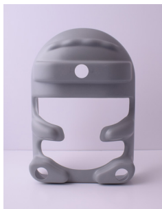
Safe-Turn Pro Cradle

The Safe-Turn Airway offers all the same features of the Safe-Turn Pro with one difference. The extra cut in the Cradle is designed to accommodate more rigid ET Tubing. The Safe-Turn Airway also allows you to position a patient without the need to disconnect the patient's ET Tubing (when using the Split Prone Face Cushion).