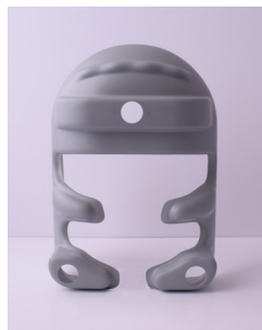
Safe-Turn Airway Cradle