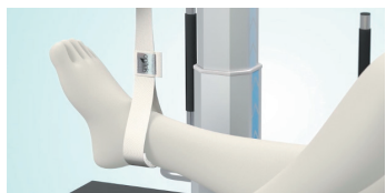
LIFTING STRAP 2006-50