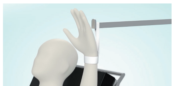
LIFTING STRAP 2006-60

Supports: arm, fingers, forefoot and ankle.