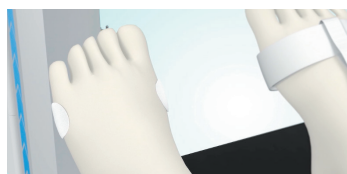
ADHESIVE VELCRO COIN 2006-65

For forefoot & finger lifting. Non allergenic.